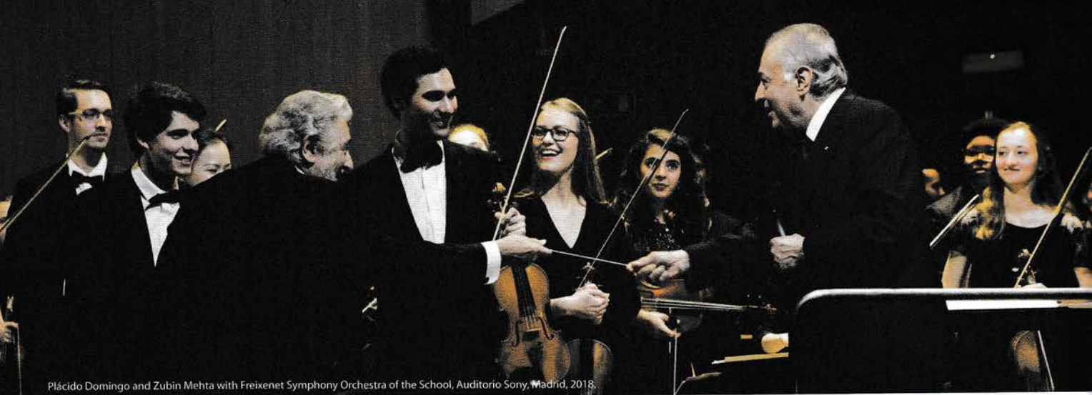
Plácido Domingo and Zubin Mehta with Freixenet Symphony Orchestra of the School, Auditorio Sony, Madrid, 2018.